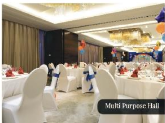
Multi Purpose Hall